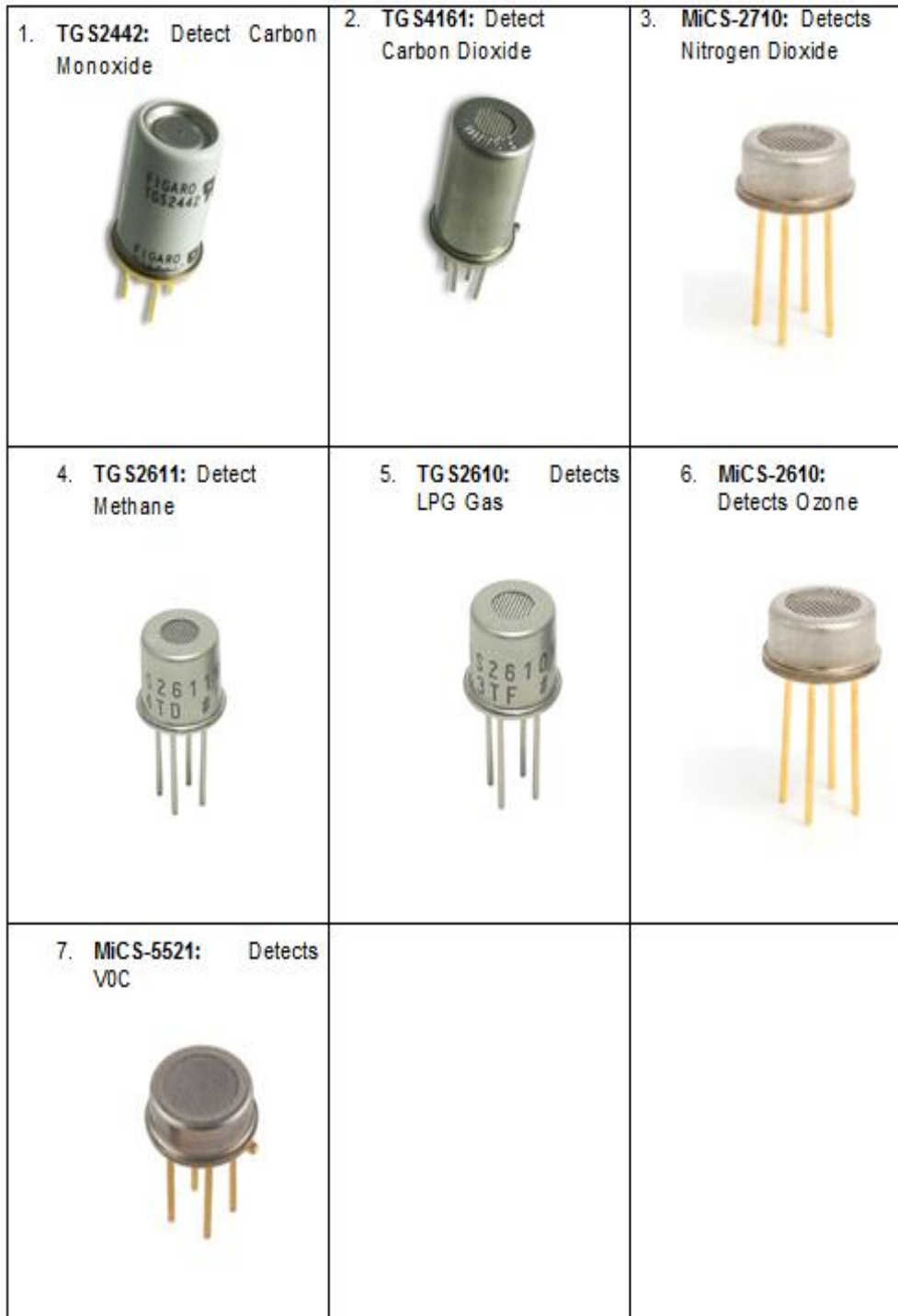
Fig-4. Libelium Gas Sensors