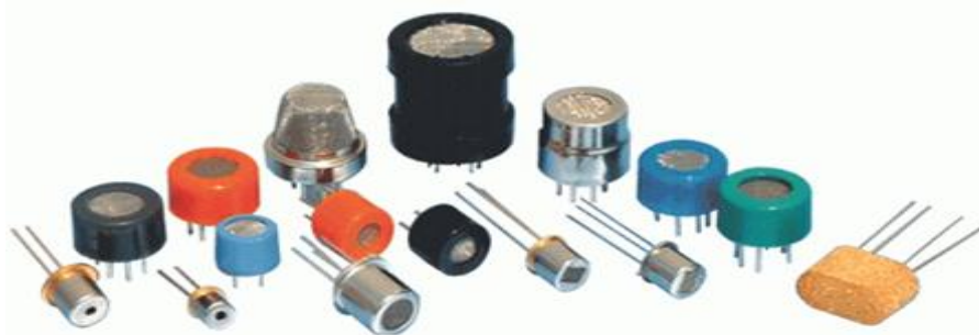
Fig-1. Semiconductor-Type Gas Sensors

Semiconductor Gas Sensors (also known as Metal Oxide Sensors) are electrical conductivity sensors. Sensors active sensing layer changes coming in contact with gas. The gas actually reacts with the sensor surface in a completely reversible reaction. Because of their chemical composition cum properties, Semiconductor gas sensors are highly recommended for detection of all sorts of reactive gases. Depending on the manufacturing quality of sensor, the operating temperature of sensor ranges between 300°C to 900°C.