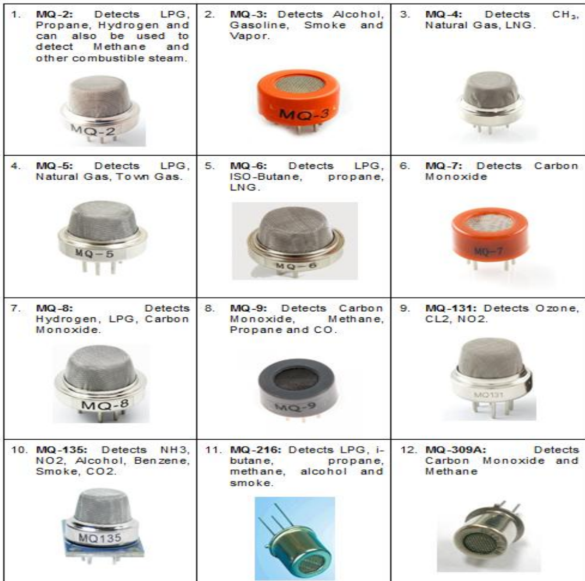
Fig-3. The types of MQ Series Gas Sensors