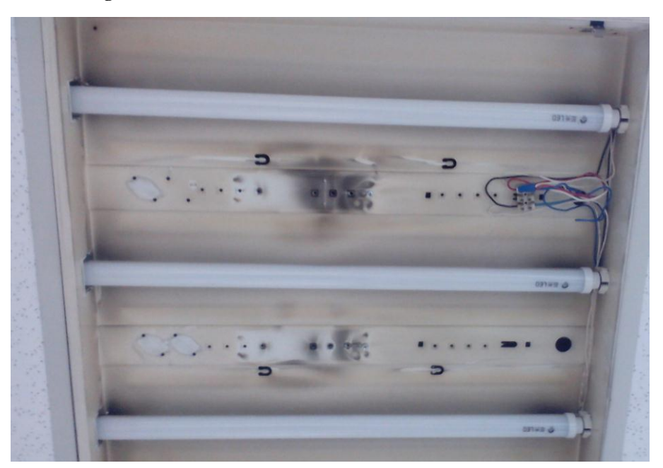
Figure-2. Florescent Fixture Modified to Accommodate LED's

T8 PC-LED's were selected to fit existing florescent fixtures and sockets. Since LED's did not require starters and ballasts (but needed drivers to convert AC to DC power) fixtures were modified per Figure 2.