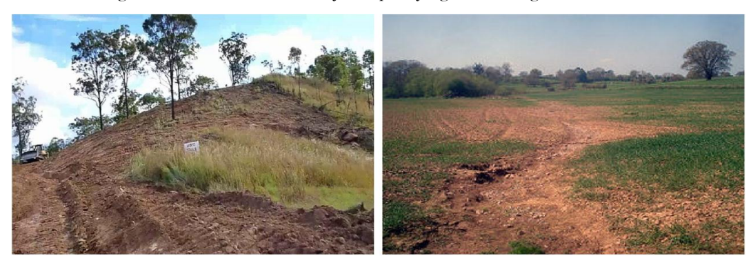
Plate-6. Degraded arable lands caused by the quarrying and mining of rock materials

Arable land for farming are getting depleted in these mining district and farmers are forced to cultivate less fertile lands, thus, reducing productivity. In many areas, this overburden materials excavated are deposited as tailing heaps, and in some cases are leveled and spread over large areas using bulldozers. After the lush vegetation of the land in which mining operation is carried out has been removed, the area rarely recovers (see plate 6). This is because there is no longer good root system to anchor the topsoil or decaying plant matter to replenish the nutrients. If this is allowed to continue over a long period of time, the area may eventually transits to a desert land. The consequence of this environmental impact on the life of the people is low food production and this leads to hunger and starvation. In other cases, some mineral deposits such as marble are found within agricultural areas such as cocoa plantations. An attempt to mine these deposits results in the destruction of so many of the economic trees, which are destroyed during surface mining of marble. Such farmlands have been destroyed at some marble quarried at Igarra.