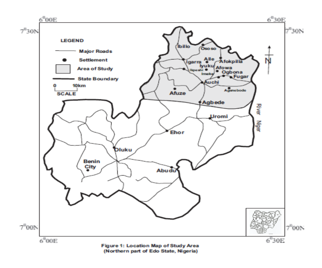
Review of Environment and Earth Sciences, 2014, 1(1): 24-36