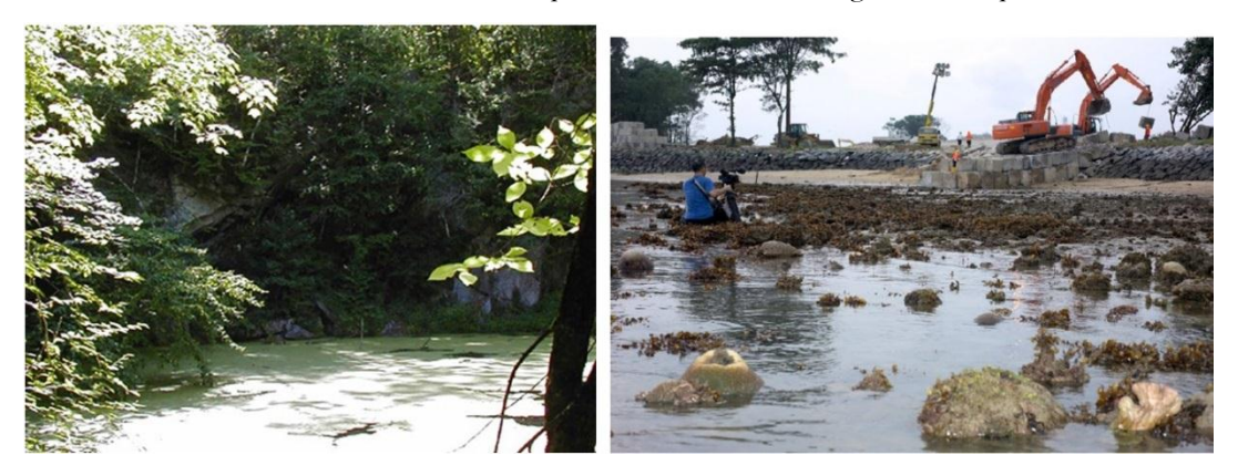
Plate-1. Abandoned mine pits filled with water in Igarra and Ikpeshi

This is easily noticed in the quarry sites where, the aesthetic value of the environment is totally reduced. The presence of several mine pits makes the area unsightly. The common wastes generated by the open pit method of mining are overburden materials and waste rocks. These wastes are dumped as heaps by the side of the pits, which generally have steep slopes and are unstable, so sliding frequently occurs. Common sites are observed at granite quarries at Imeke and marble quarries at Ikpeshi and Igarra. Some of the pits are filled up with water to create ponds or artificial lakes. Observation also shows that most of these ponds are being used as breeding grounds for mosquitoes, algae and reptiles. In some cases, they are used by the inhabitants as source of drinking water as well as swimming pools (see plate 1).