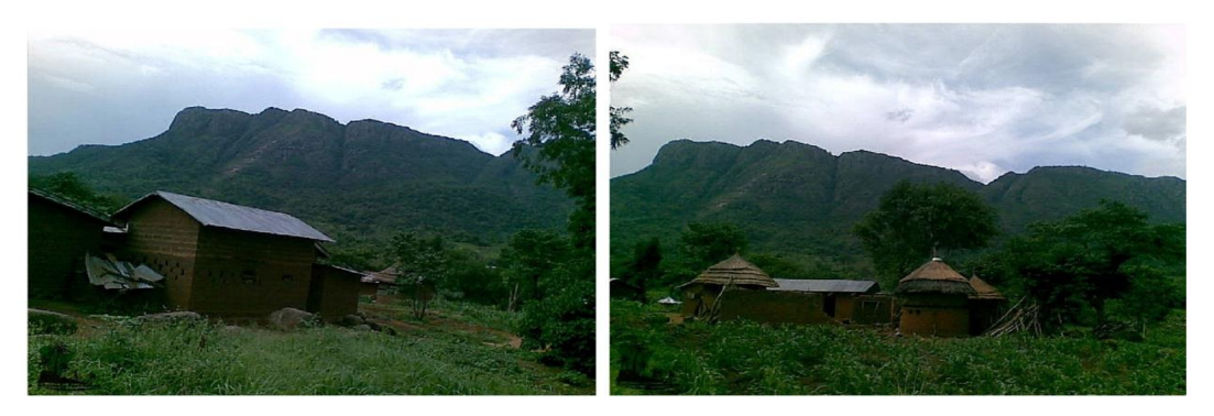
Plate-4. dilapidated buildings residing by indigents of the mine and quarried communities

The shock waves generated by the explosion of the dynamites travel considerable distance away from the quarry sites and are also accompanied with very loud noise, which have devastating effect on persons, buildings and the surrounding communities. This action is very much pronounced where granite quarries are not too far from residential buildings. Cracked and dilapidated buildings caused by these activities are common sight at Ikeshi and Igarra (see plate 4).