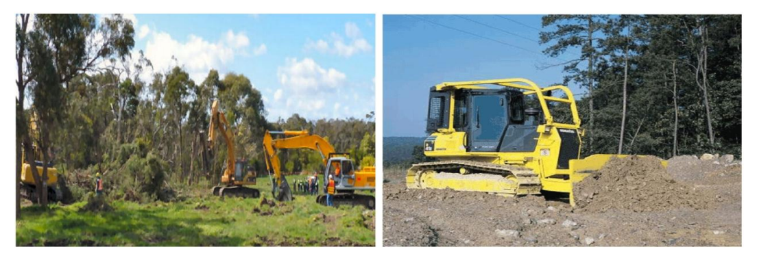
Plate-5.Bulldozer bringing down forest trees and removal of topsoil for quarry site

migrated away or are exterminated. Hunting is seldom practiced as compared with southern part of the state where no such mining is done, and is very rich in avian (cattle egrets, kites, vultures and sparrows) reptilian (Iguana, snakes and crocodiles) and mammalian (monkey, antelopes and deer).