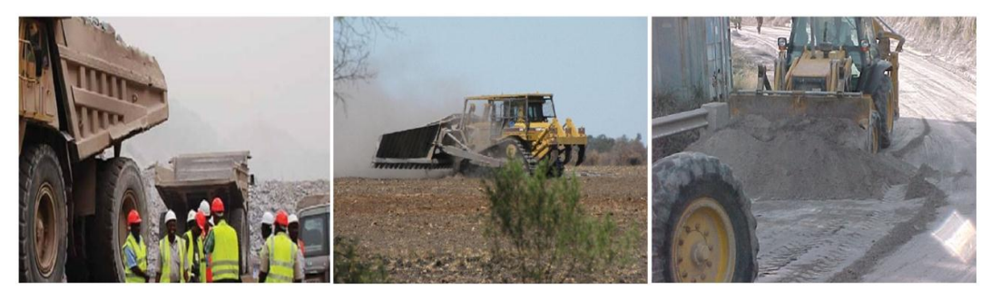
Plate-3. Gaseous particles emitted into the atmosphere from mine sites

The burning of the fuels used by generator and heavy-duty vehicles in quarries and processing sites has contributed tremendously to the increase in carbon dioxide in the environment. The significance of this increase in carbon dioxide production is its potential for raising the temperature of the earth through the process known as the "green house effect" [12]. Carbon dioxide in the atmosphere prevents the escape of outgoing long-wave radiation from the earth to outer space; as more heat is produced and less escape, the temperature of the earth increases [13]. The contribution of the activities of quarry and mining is a significant of global warming of the atmosphere, which invariable would have serious environmental effects. Global warming of the atmosphere could result in: