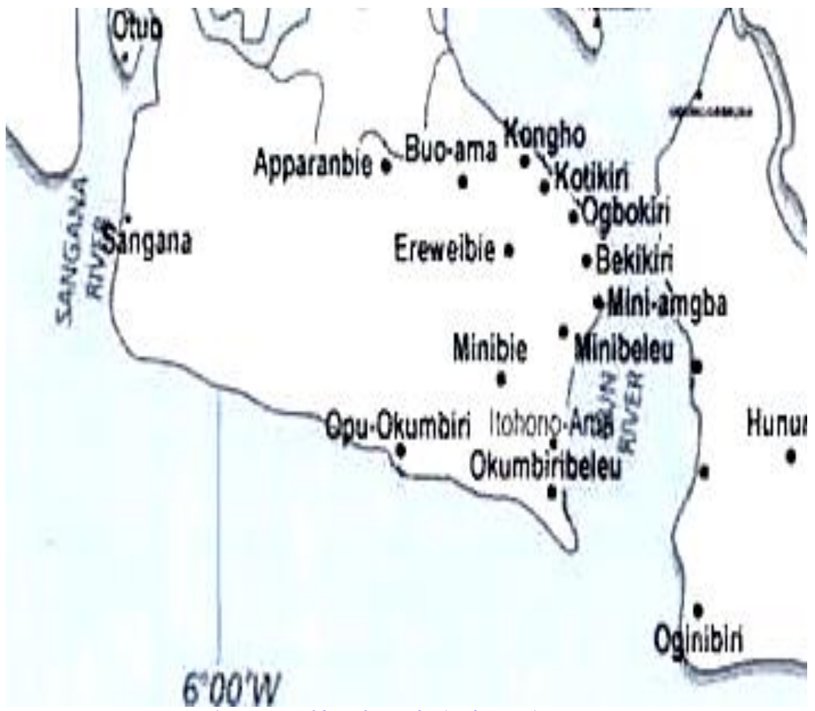
Figure 1. Map of the study area, showing the Nun River Estuary.

Figure 1 illustrates the different sampling point on River Nun in the Akassa axis.