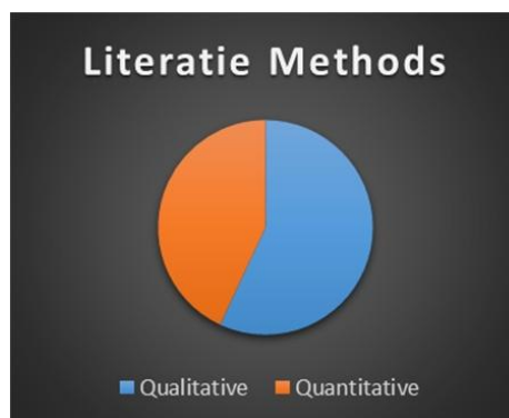
Figure-1. Literature methods.

The qualitative research's primary means of gauging findings from Table 2 reveals that it can be considerably better than the quantitative approaches used in Table 2 (100%). People concentrate on the qualitative aspects of study due to developing the blockchain in Asia, inhibiting the latter's growth. We advocate the use of blockchain technologies to advance to the quantitative findings also, as soon as possible in this case.