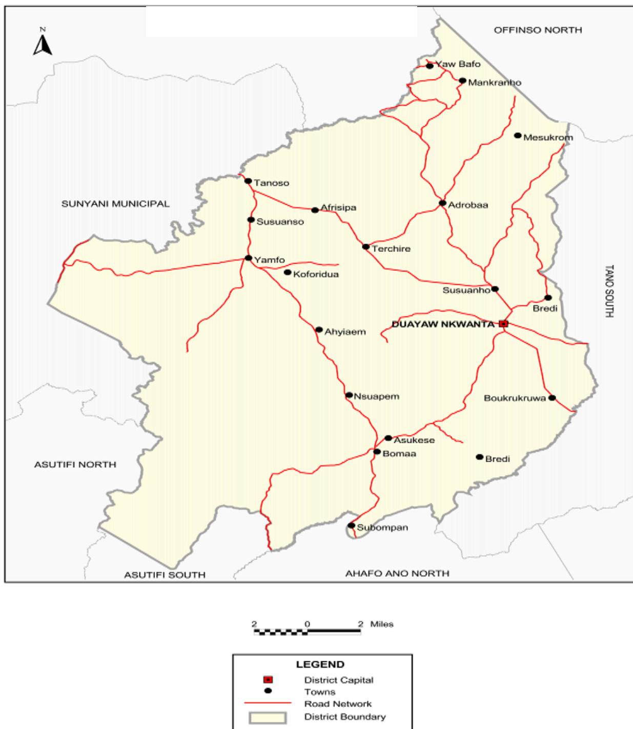
Figure-1. Map of Tano North.