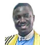
(+ Corresponding author)

3 Tamale College of Education, Tamale, Ghana.