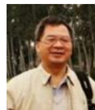
(+ Corresponding author)