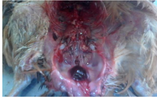
Bursa inflamed and reddish