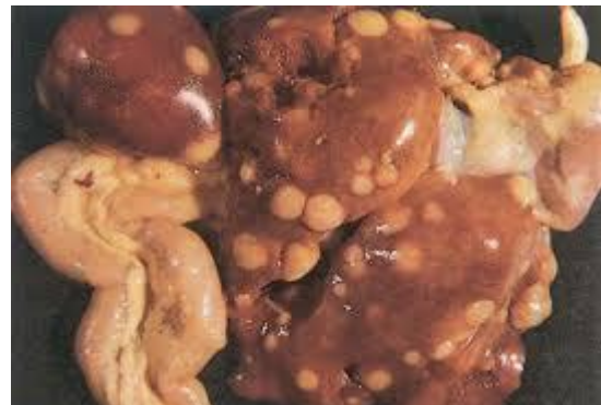
Fig-1. White nodules on liver surface