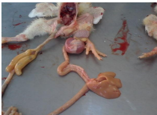
Fig-1. Liver pale colored