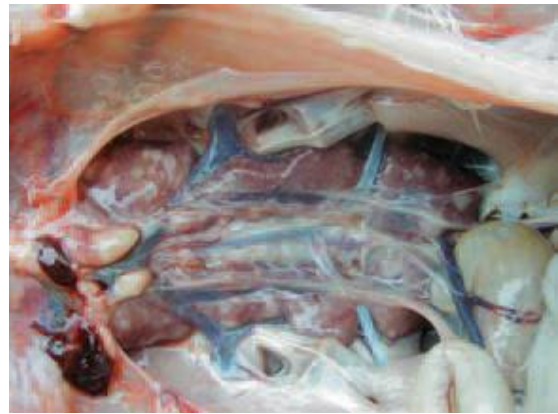
Necrotic lesion on kidney

Treatment: No treatment due to viral disease, but to avoid the secondary infection, we recommend the supportive therapy in drinking water.