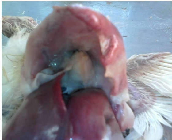
Fig-2. Serous coats on pericardium