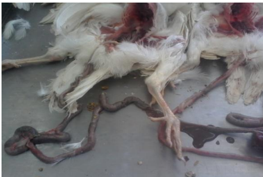
Fig-1. Dark and blood mixed feces