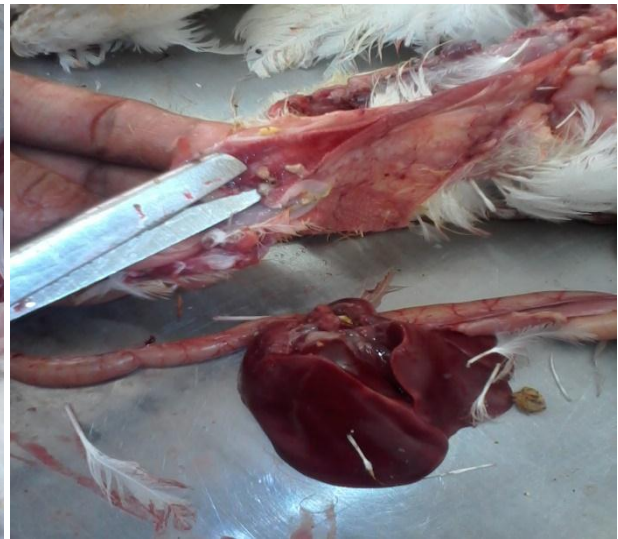
Plaques in trachea