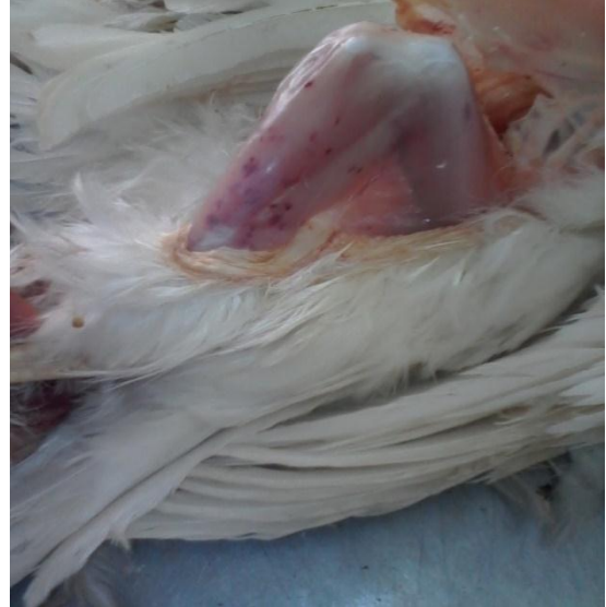
Haemorrhages on thigh muscle