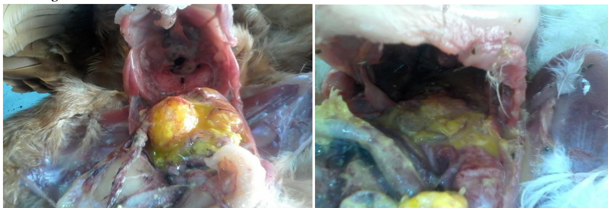
Fig-1. Free egg yolk in the body (egg yolk break brown and mix in the abdomen)