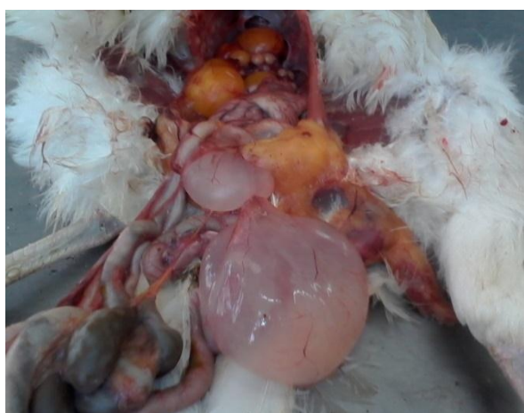
Fig-1. Reproductive form salpingitis

3 forms 1) Reproductive, 2) Respiratory, 3) Renal form