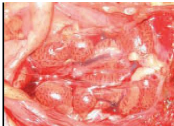
Kidneys are enlarged with hemorrhages