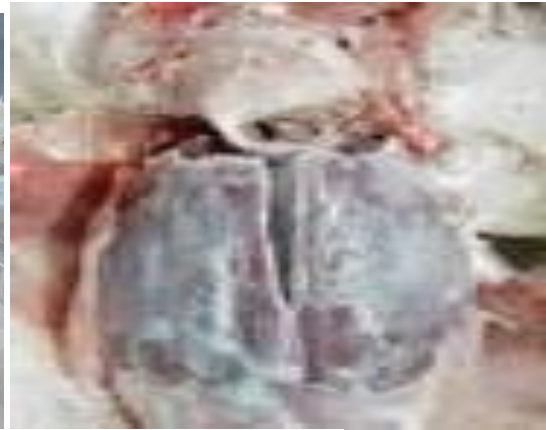
Serofibrinous polyserositis on liver