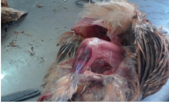
Fig-1. Hemorrhages on thigh region