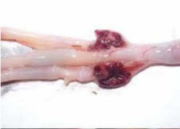
Fig-2. Caecal tonsillitis