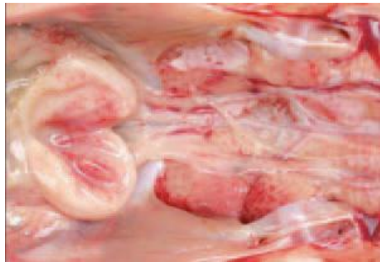
Fig-2. Cheesy material in Bursa