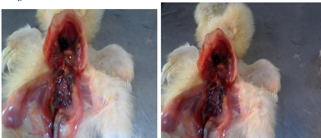
Fig-1. Lesions (yellow or gray nodules and/or plaques in the lungs and on air sac.