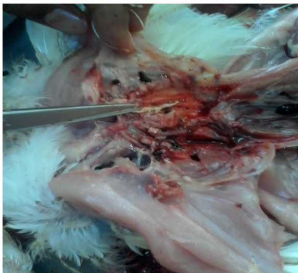
Fig-3. Plaques in trachea (respiratory)