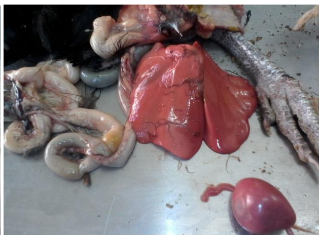
Spleen and liver enlarged