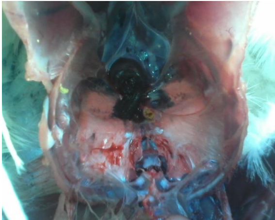
Fig-1. Cloudy air sac