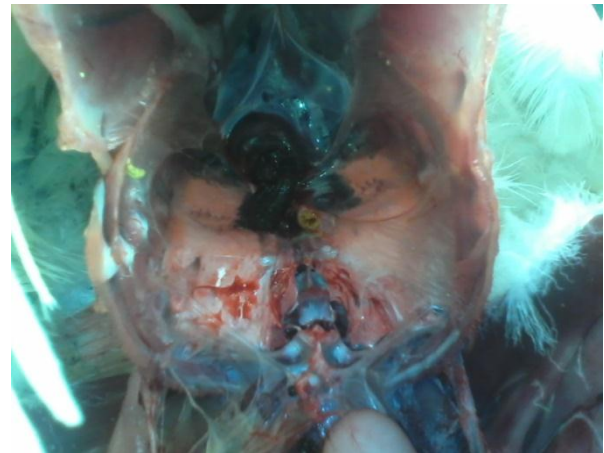
Cloudy air sac