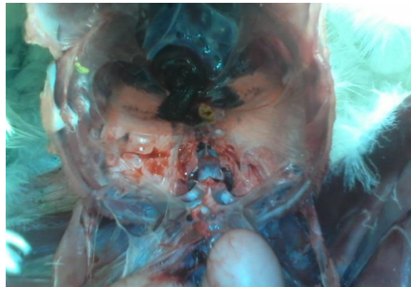
Fig-2. Cloudy air sac