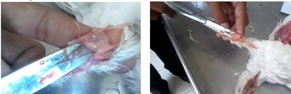
Fig-1. Diphtheritic form (plaques in trachea)