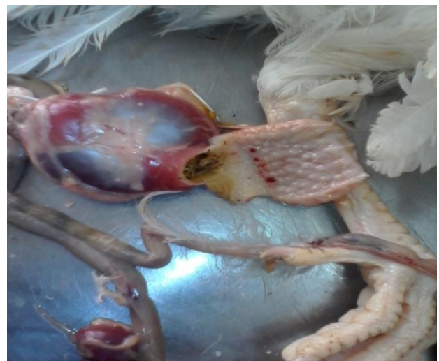
Hemorrhages between proventriculus and gizzards

Treatment: No treatment due to viral disease, but to avoid the secondary infection, we recommend the supportive therapy in drinking water