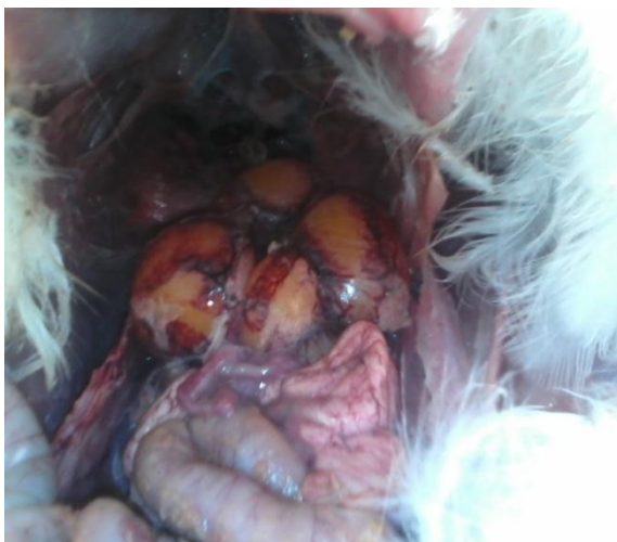
Fig-1. Egg yolk hyperemic and abnormal ovum