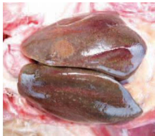
Enlarged liver is mottled with millitary necroses

Symptoms: Lethargy, diarrhea, conjunctivitis, liver, spleen, and kidney enlarged.