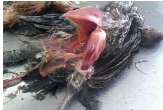
Haemorrhages on thigh region

Treatment: No treatment due to viral disease, but to avoid the secondary infection, we recommend the supportive therapy in drinking water.