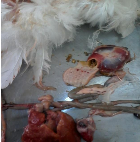
Fig-1. Haemorrhages on proventriculus