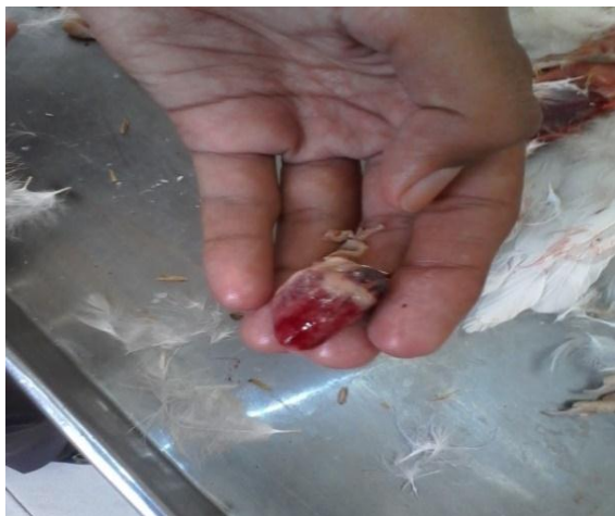
Fig-2. Haemorrhages on heart