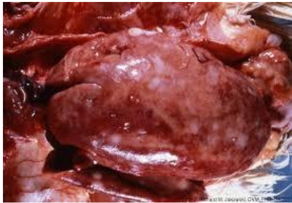
Fig-2. White nodules on liver surface