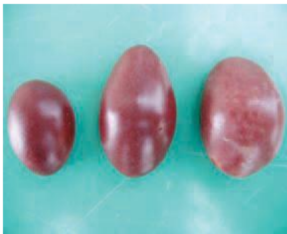
Fig-2. Spleen enlarged