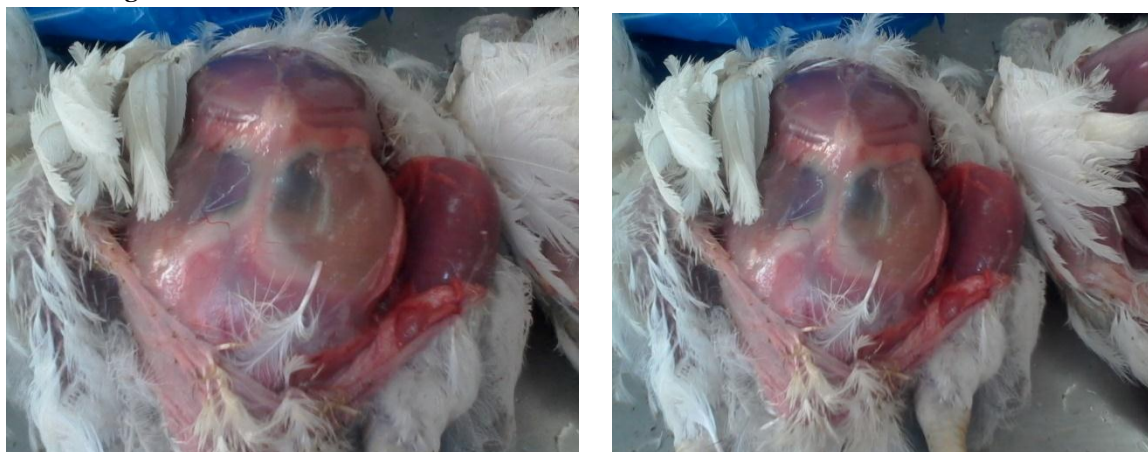
Fig-1. Fluid in the abdomen

Treatment: To avoid the secondary infection, we recommend the specific and supportive therapy in drinking water.