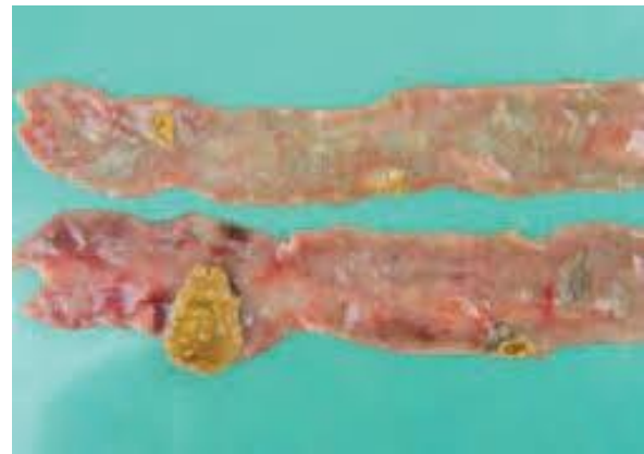
Petechial haemorrhages and ulcer on intestine

Treatment : No treatment due to viral disease, but to avoid the secondary infection, we recommend the supportive therapy in drinking water.