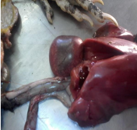
Fig-1. Inflamed liver and spleen