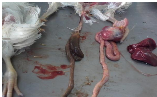
Fig-2. Dark and blood mixed feces