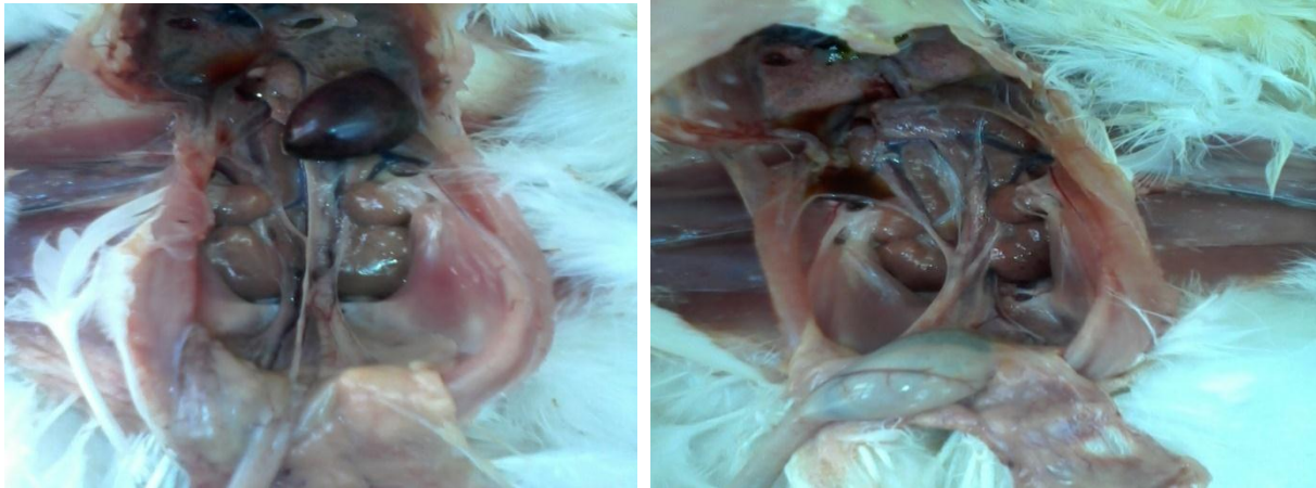
Fig-1. Kidney enlarged and emaciated and pale color muscle.

Treatment: To avoid the secondary infection, we recommend the specific and supportive therapy in drinking water.