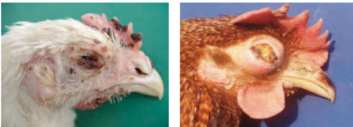
Fig-2. Dry form: wart-like nodules on the skin (combs face and wattles)

Treatment: No treatment due to viral disease, but to avoid the secondary infection, we recommend the supportive therapy in drinking water.