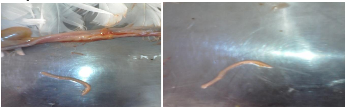
Fig-1. Round worm in intestine