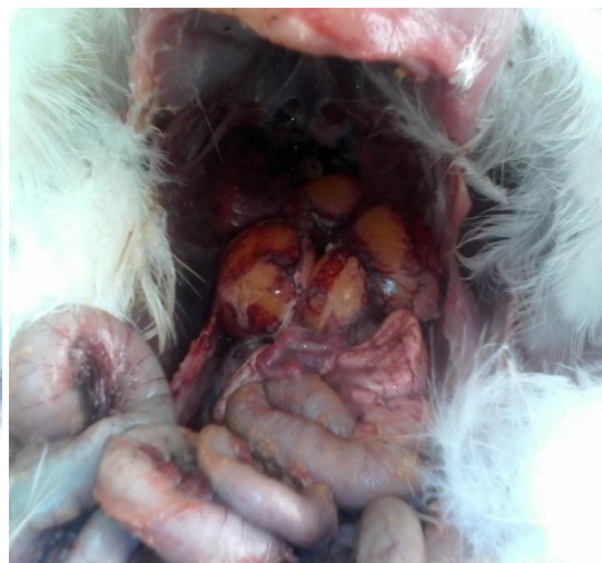
Inflammation of the intestine