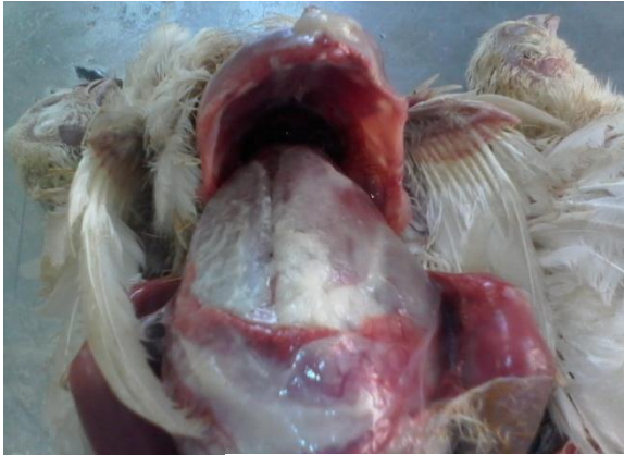
Fig-1. Serous coats (peritoneum)