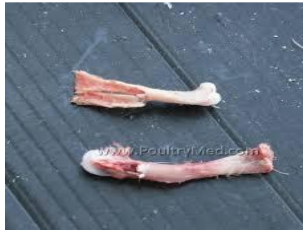
Pale color bone marrow