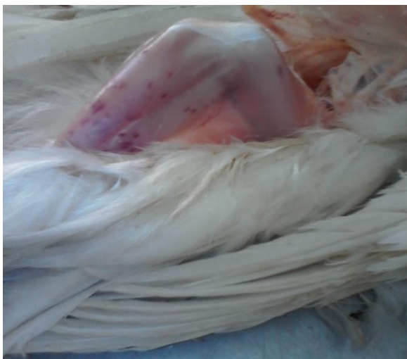
Fig-3. Hemorrhages on thigh