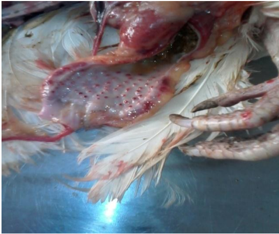
Fig-1. Haemorrhages on proventriculus