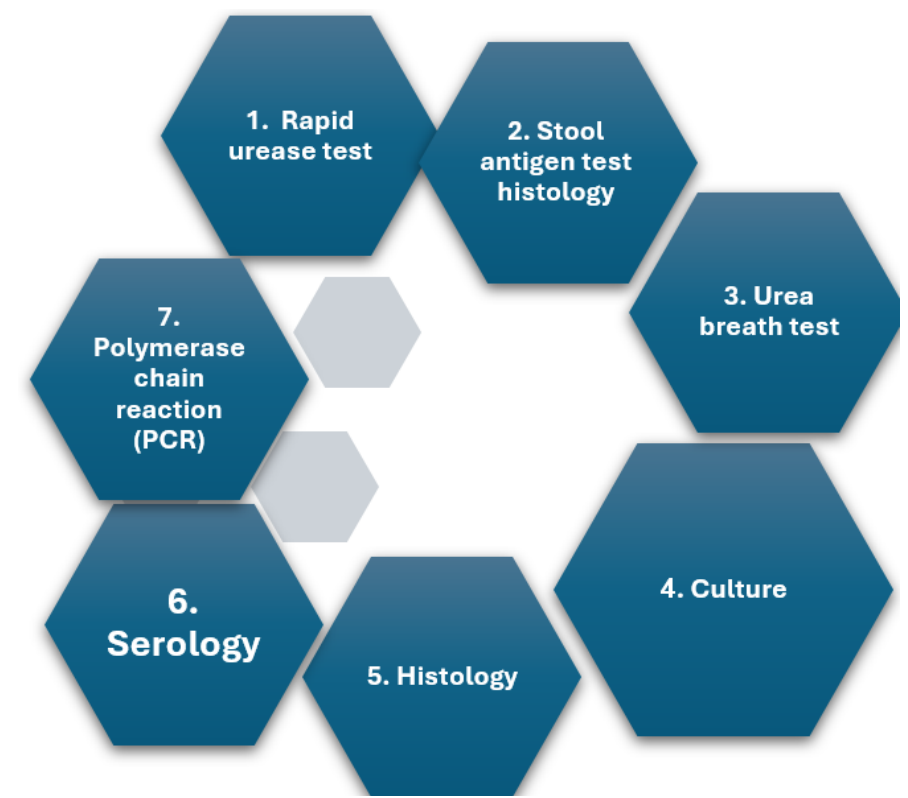
Figure 2. Presents the available diagnostic tools of H. pylori according to Katelaris, et al. [95].

There are many available direct and indirect diagnostic tools of zoonotic H. pylori available in both human and animals' fields as shown in Figure 2.