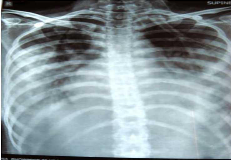
Figure-1. X ray of chest in supine position showing bilateral pulmonary oedema.