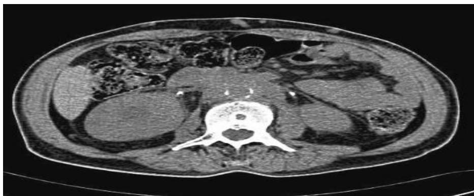
Figure-1. RPF BT